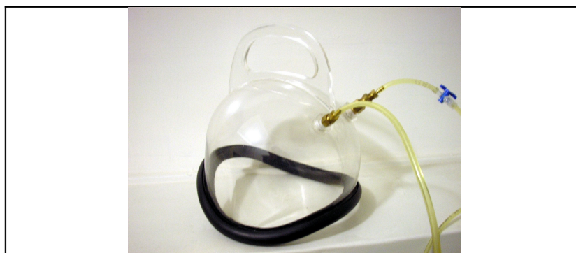
Figure 2 . Vacuum's bell photo.

It must be made of a sufficiently rigid material so that it can support the differential pressure without any deformation. The bell compartment must have a light weight so as to not bother the patient and avoid increasing the IAP, in rest situation. It must also have a right height so that it does not interfere with other existing instruments in the terminal care facilities, and also to improve its storage and its and positioning.